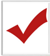
Exhibit D: Advocacy