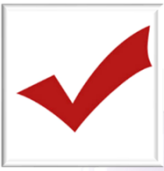
Exhibit C: Education & Information